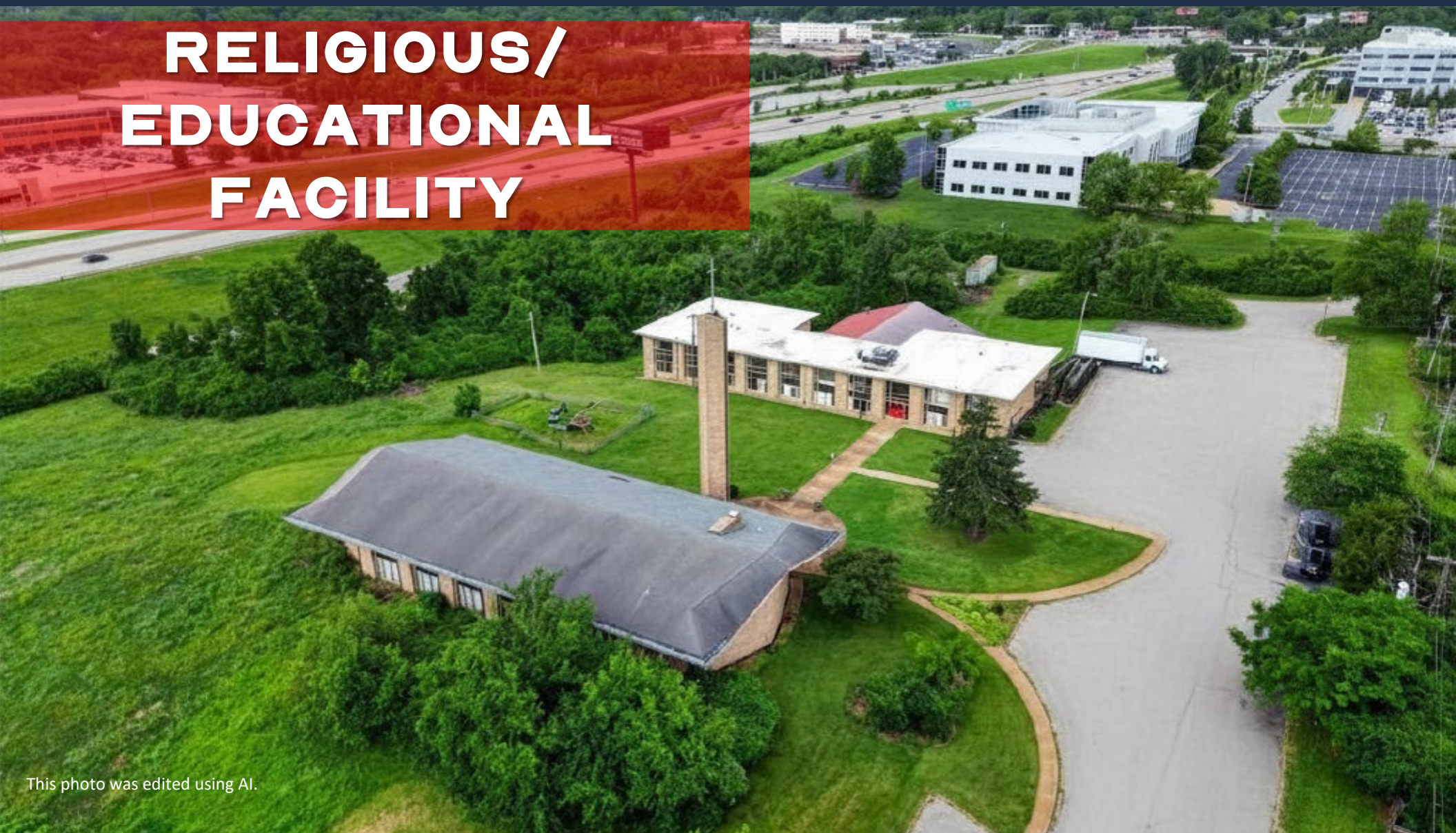
This photo was edited using AI.